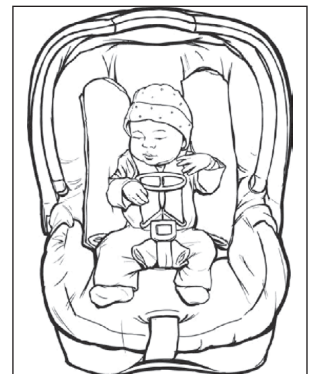
Figure 4. Car safety seat with a small cloth between the crotch strap and infant; chest clip positioned at the center of the chest, even with the infant's armpits; and tightly rolled receiving blankets on both sides of the infant.

A: Bulky clothing, including winter coats and snowsuits, can compress in a crash and leave the straps too loose to restrain your child, leading to increased risk of injury. Ideally, dress your baby in thinner layers and wrap a coat or blanket around your baby over the buckled harness straps if needed.