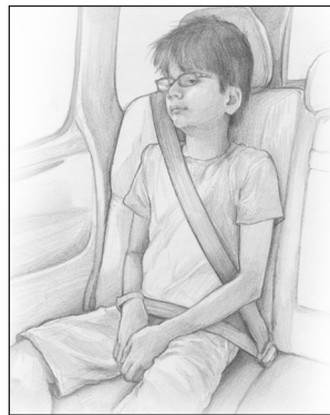
Figure 7. Lap and shoulder seat belts.

A: Lap belts work fine with rear-facing-only, convertible, and forward-facing seats that have a harness but can never be used with a booster seat. If your car has only lap belts, use a forward-facing seat that has a harness and higher weight limits. You could also